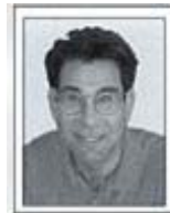
By Marne Coggan

THE WINE industry seems to have a schizophrenic attitude about ozone. Many wineries use ozone and are thoroughly delighted with its efficacy as a sanitizer and its safety. Other wineries have had negative experiences with ozone in the cellar. Still others have had no experience, but have heard of workers refusing to use ozone or of ominous consequences from run-away generators. Too often, ozone's virtues seem to have been oversold and its drawbacks overblown. Myths, misinformation, conflicting claims, and even irrational fear abound.